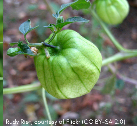
Rudy Riet, courtesy of Flickr (CC BY-SA 2.0)