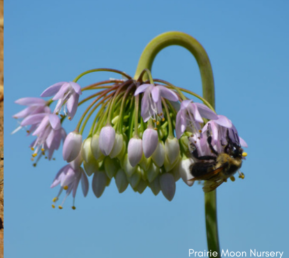
Prairie Moon Nursery