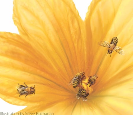
Illustration by Steve Buchanan