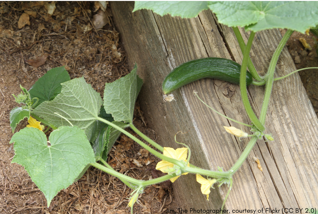
Jim, The Photographer, courtesy of Flickr (CC BY 2.0)