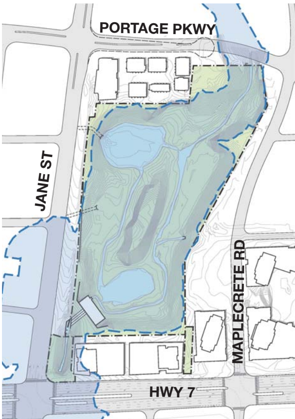
CURRENT LIMITS OF REGULATORY FLOODPLANE (HURRICANE HAZEL 1954)