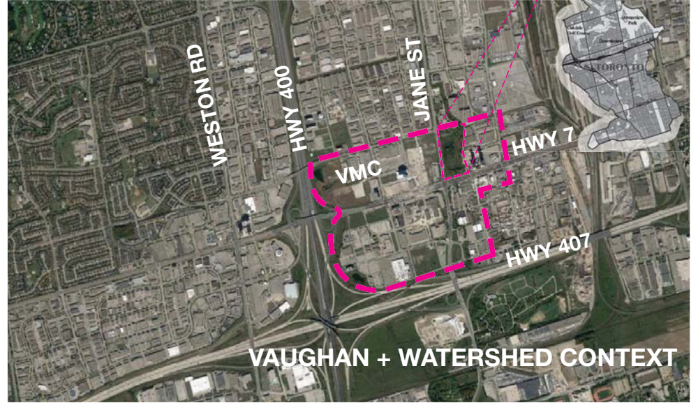
VAUGHAN + WATERSHED CONTEXT