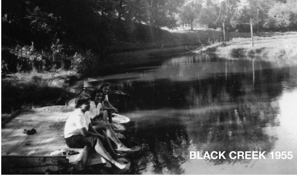
BLACK CREEK 1955