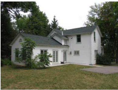
Exterior View: Side Entrance to Armstrong House