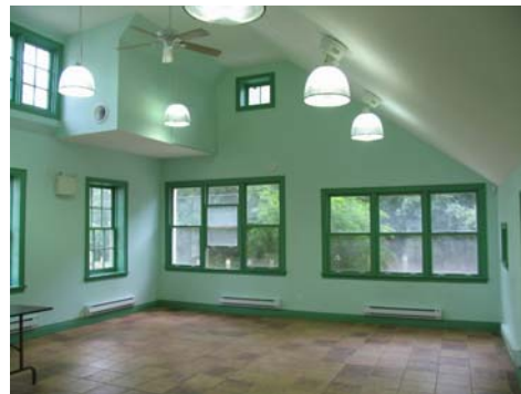
Coachhouse Studio Measurements: 24' (L) x 20' (W)