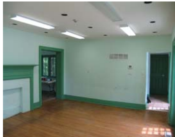
Main Level (Program Room 1) Measurements: 19' (L) x 14' (W)