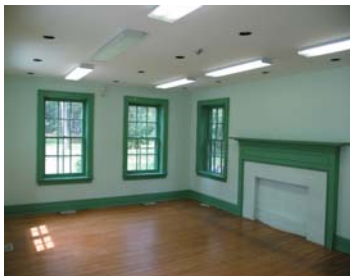
Main Level (Program Room 1) Measurements: 19' (L) x 14' (W)