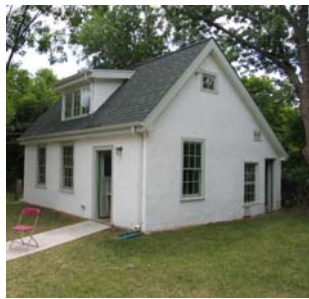
Exterior View: Coachhouse Studio