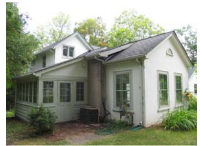
Exterior View: Back of Armstrong House