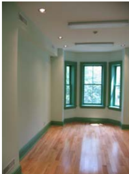
Main Level (Program Room 3) Measurements: 18' (L) x 10' (W)