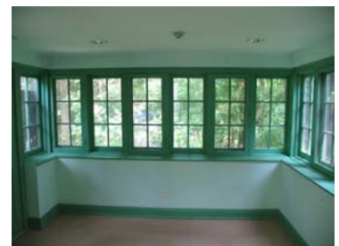
Main Level (Program Room 2) Measurements: 10' (L) x 9' (W)