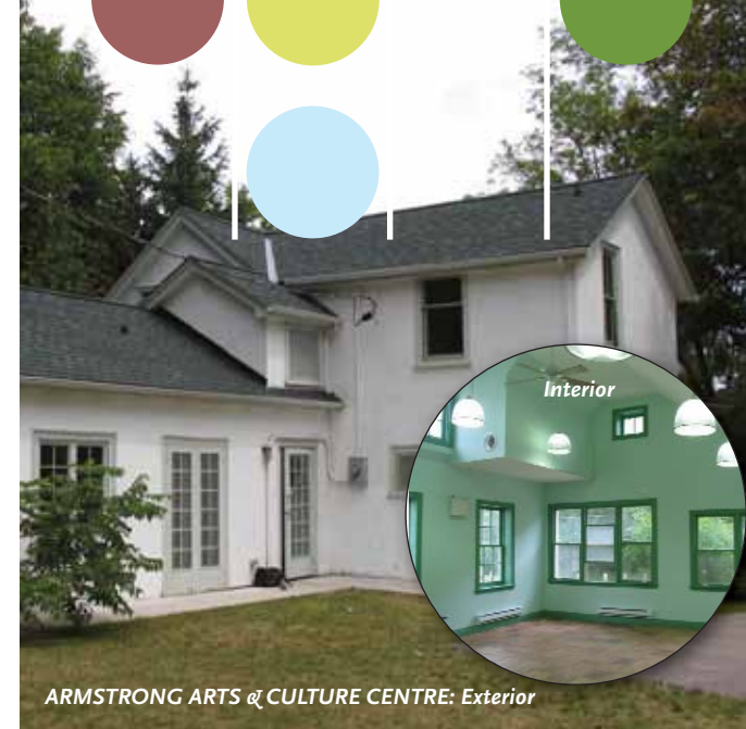
ARMSTRONG ARTS & CULTURE CENTRE: Exterior