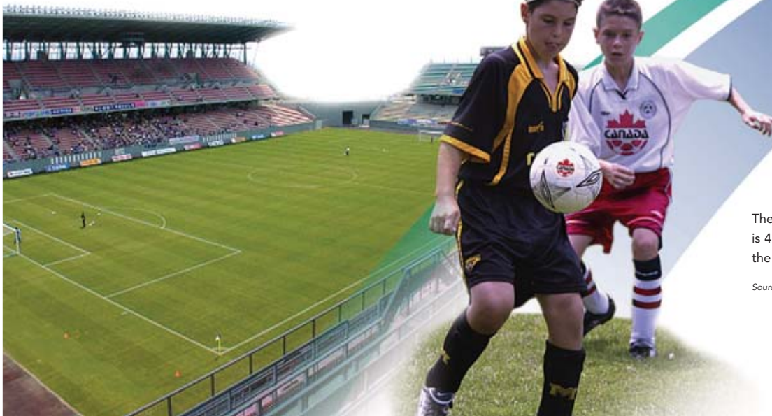
Vaughan "Kicks Off" Soccer Player Registration per 1000 population