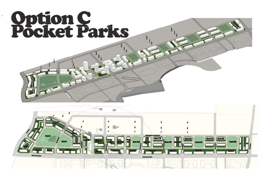
Above: Excerpt from the July 7, 2010; Landowners, Ratepayers & Councillors Workshop. Option C, Demonstration Plan.