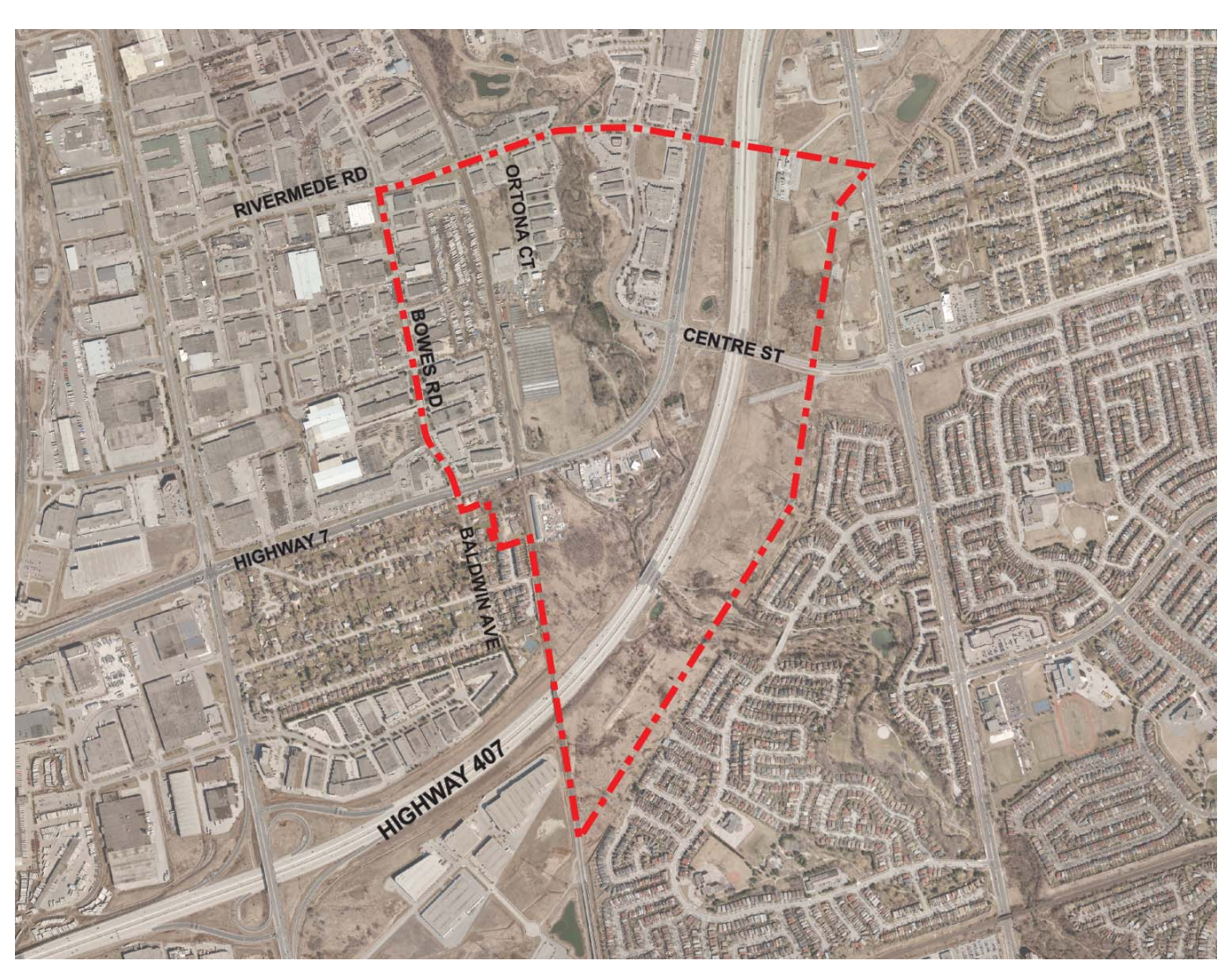
FIGURE 1: CONCORD GO CENTRE SECONDARY PLAN AREA