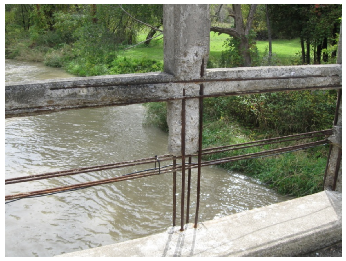
Photo 7 Vertical and Horizontal Spandrel Members showing severe spalling

Structural Existing Conditions Report for the Humber Bridge Trail Bowstring Arch Bridge Class Environmental Assessment – Draft for Discussion