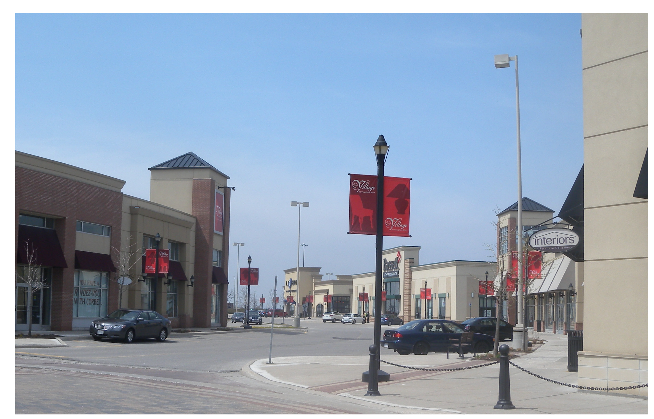
Existing commercial and office development in Vaughan Mills Centre